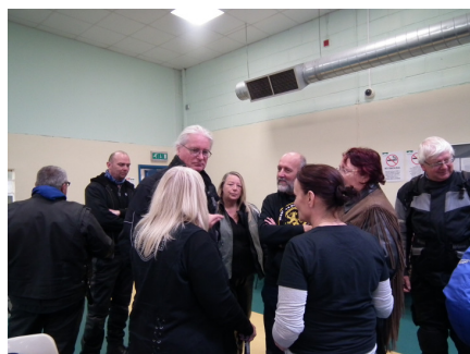
October; Bristol MAG Soup Run

Hope to see you all out and about at MAG events in 2015.