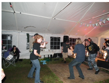
September; GWR Rally