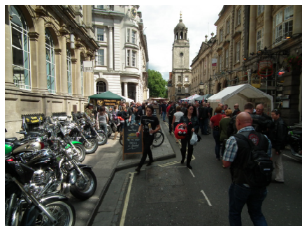
August; Bristol Bike Show