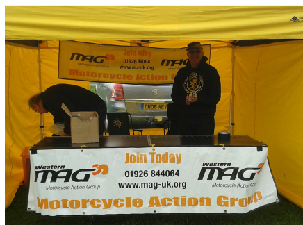
April; MAG Stand at Bike Safe

Here are just a few pictures of what we got up to in 2014