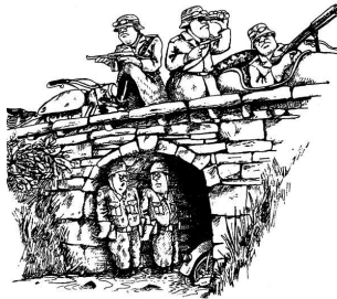
"What did you have to wave for, I told you BMW riders are a set of unfriendly bastards..."