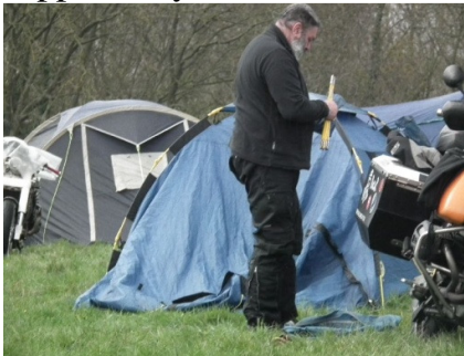
I'm sure this bit went in here?