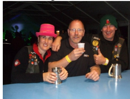
Happy campers at the GWR For such a wet year as 2012 was these events stayed dry?