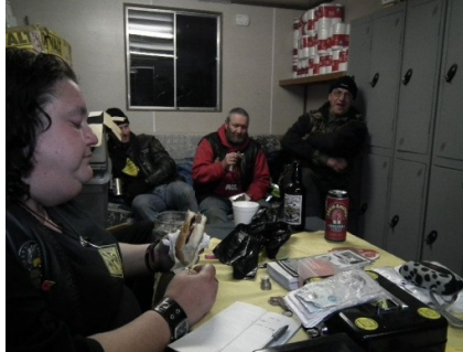
Slippit Rally staff hard at work

As news is a tad thin on the ground for this January issue of The Wrag, here are a few images from events held in 2012.