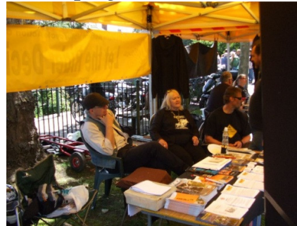
Meeting folk at Calne